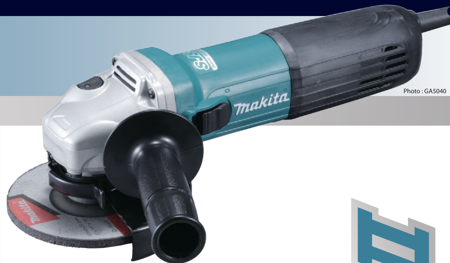
Photo : GA5040