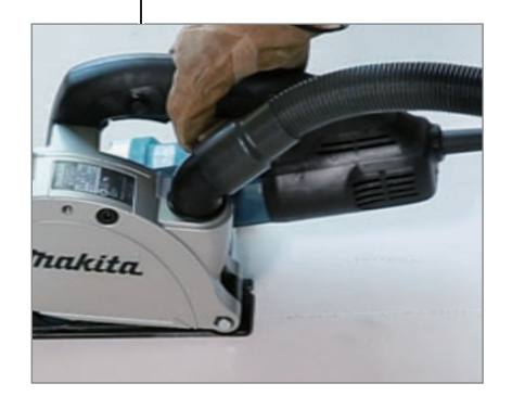
Connectable to vacuum cleaners for clean work environment