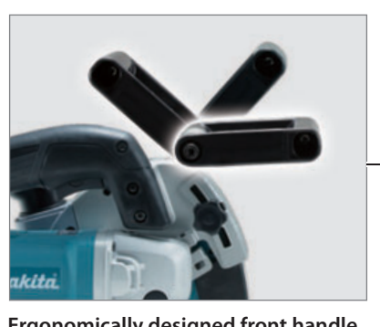
Ergonomically designed front handle