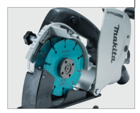
Aluminium blade case designed to allow for easy blade replacement

Overload protection Soft start Constant speed control