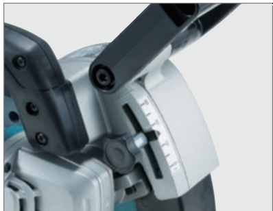
Adjustable cutting depth