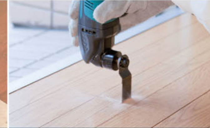
Deep plunge cutting