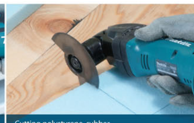
Cutting polystyrene, rubber