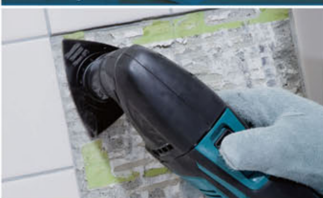
Removing mortar, tile adhesive