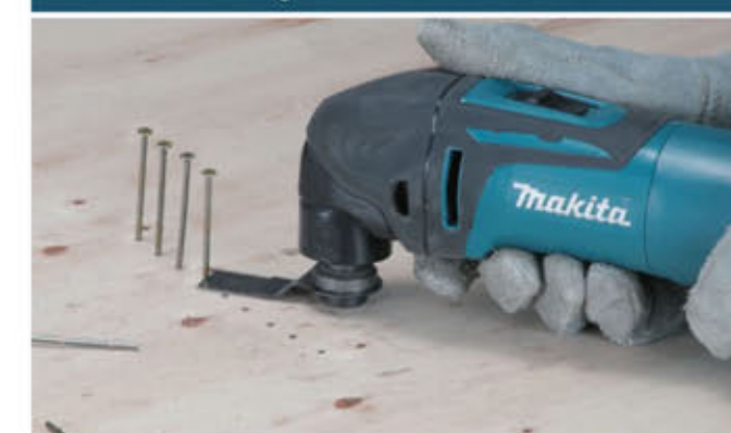
Flush cutting of nails