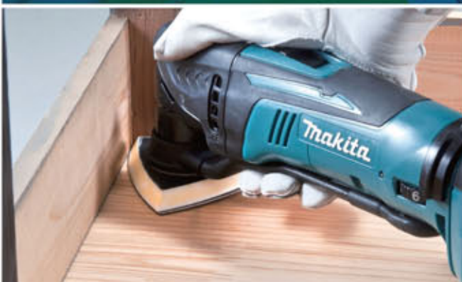
Sanding and polishing various materials