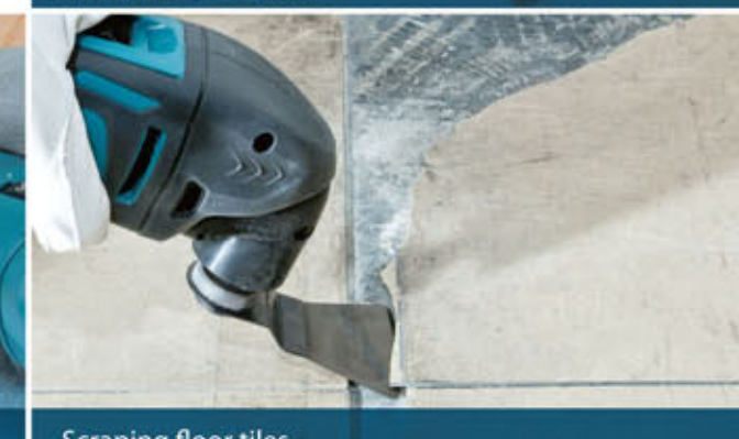
Scraping floor tiles