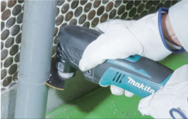
Cutting PVC, FRP pipes