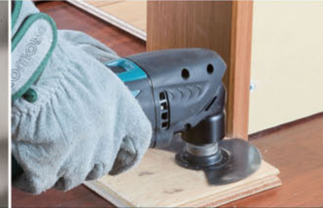
Wood flush cutting