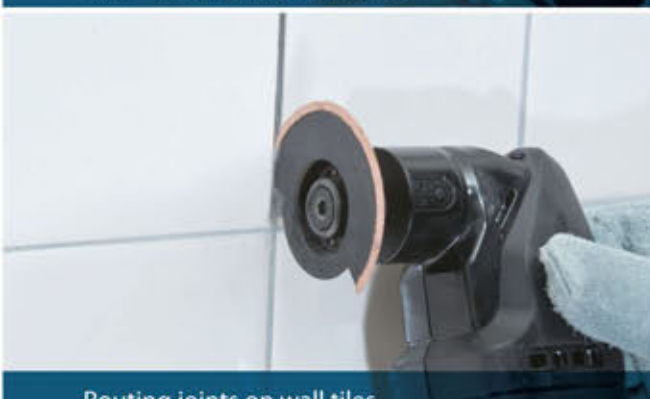
Routing joints on wall tiles