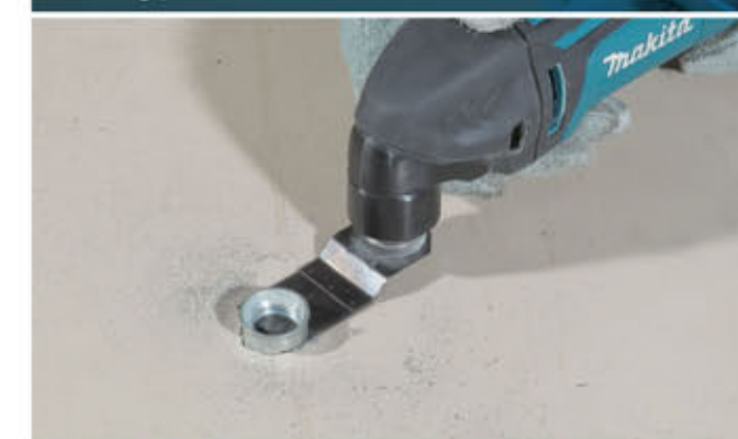
Metal flush cutting