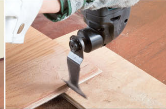
Wood plunge cutting