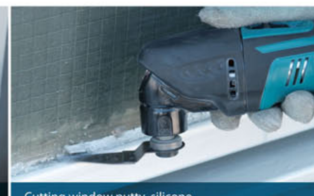
Cutting window putty, silicone