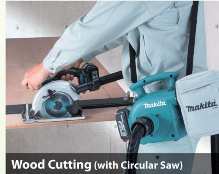
Wood Cutting (with Circular Saw)