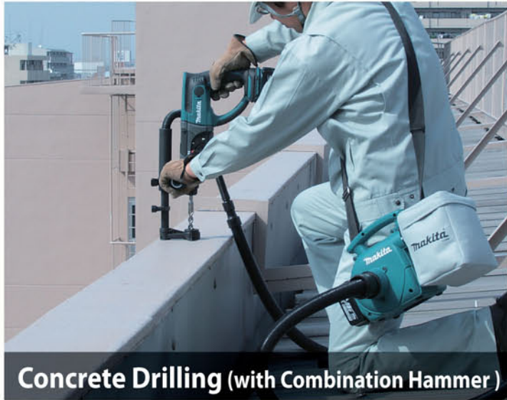
Concrete Drilling (with Combination Hammer)