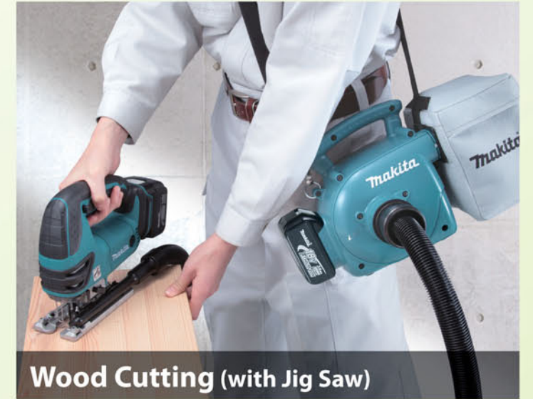
Wood Cutting (with Jig Saw)