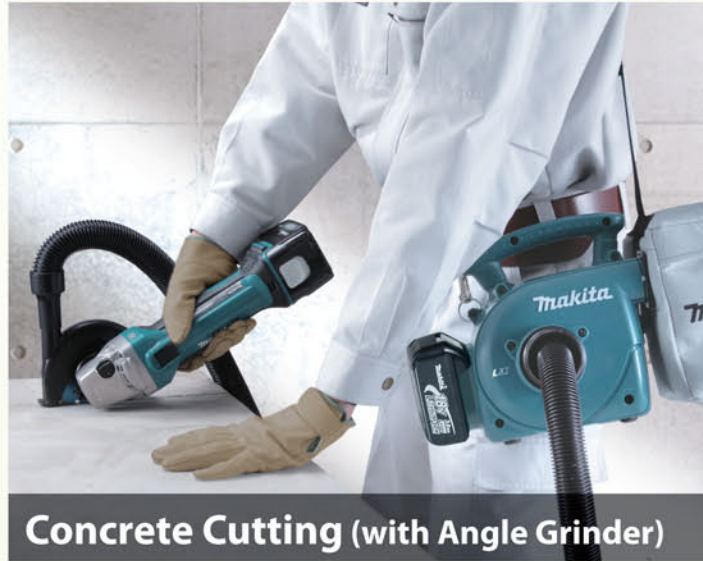
Concrete Cutting (with Angle Grinder)