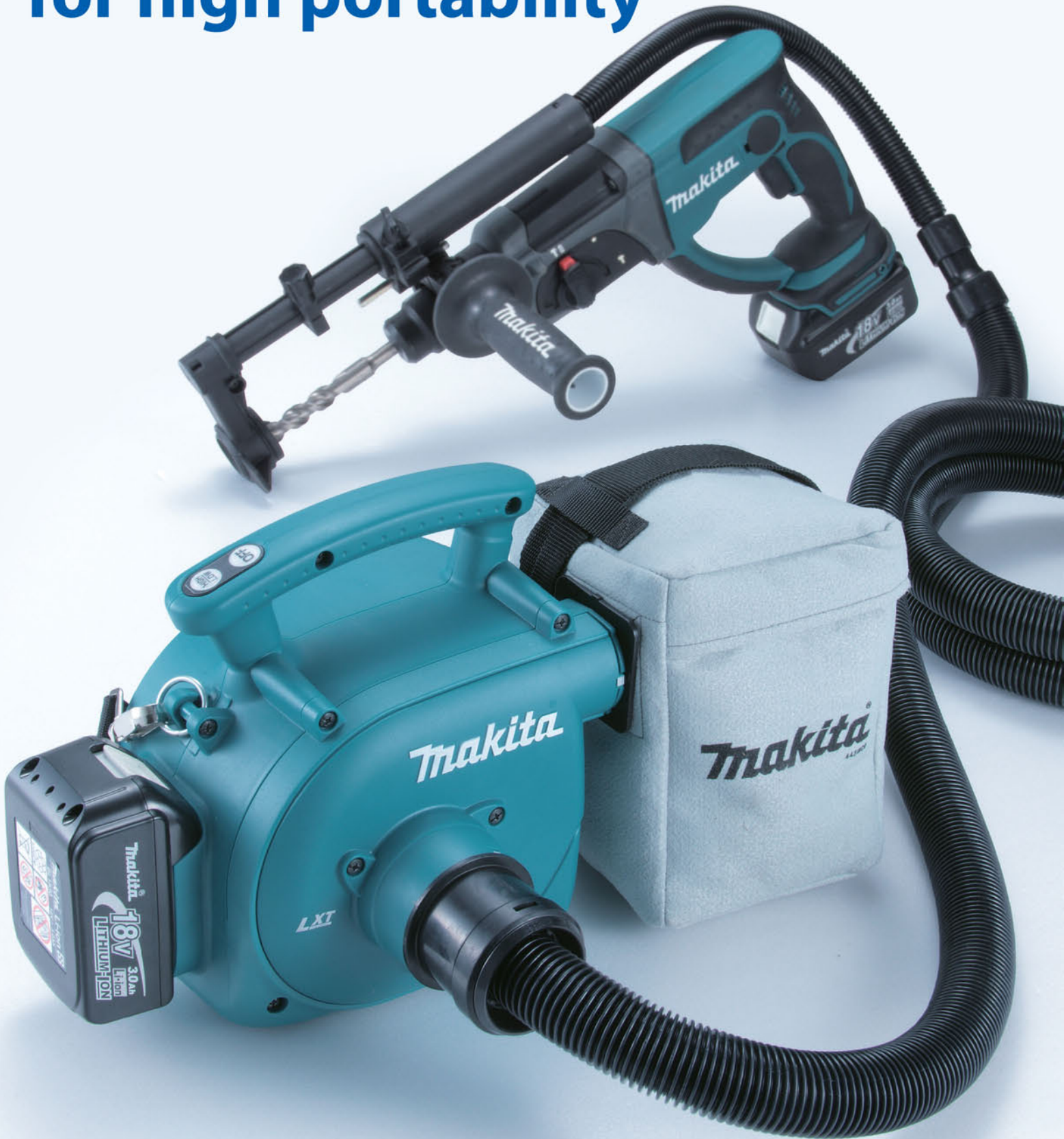
Photo: BVC350Z, BHR202 and Dust extractor attachment