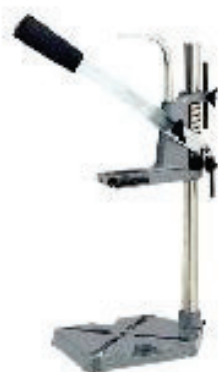
Optional Accessory Type 43 Drill Stand