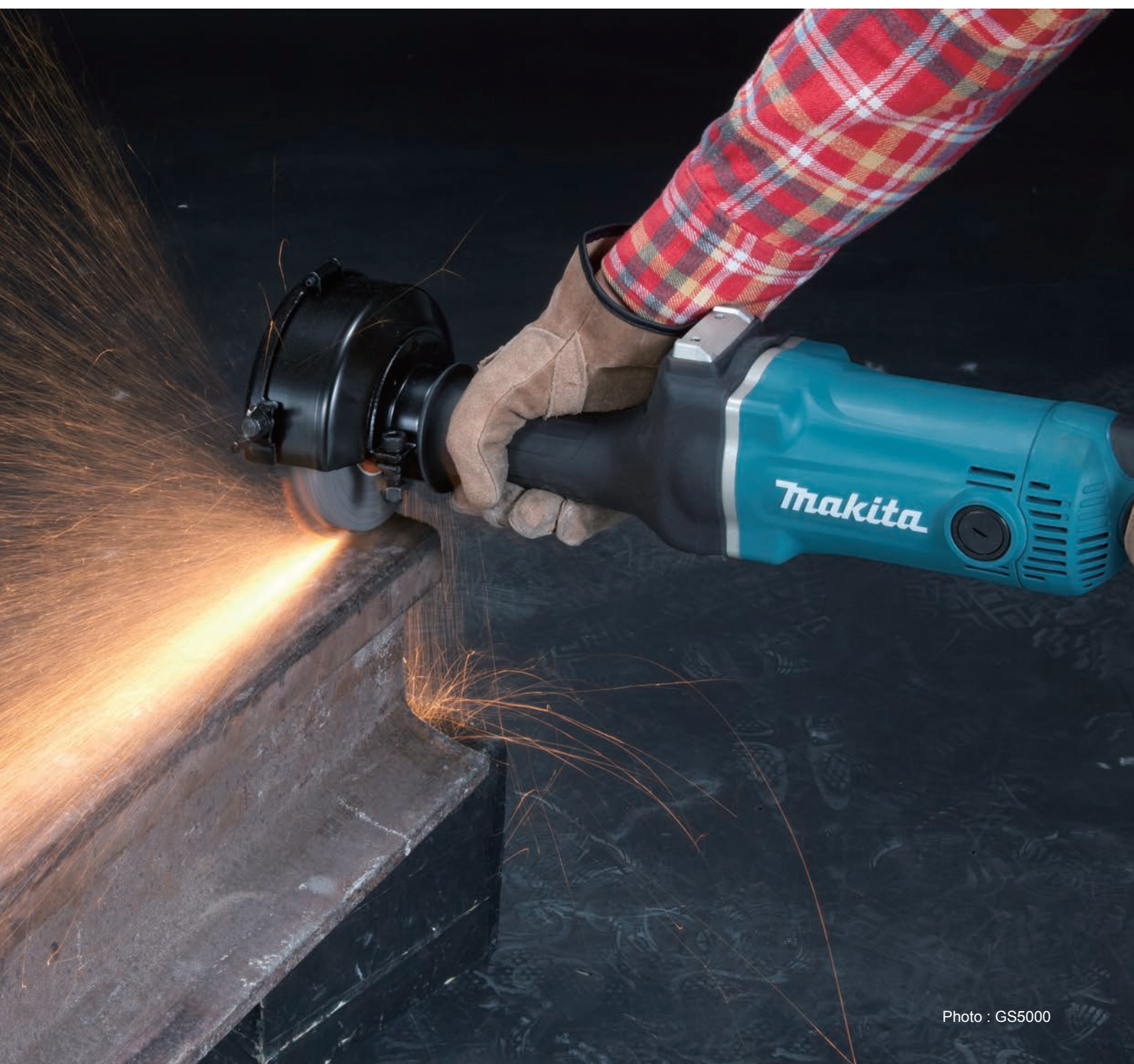
Photo : GS5000

Ergonomically design handle and barrel for added extra maneuverability.