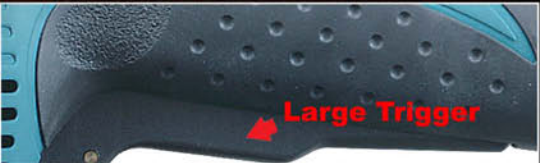
Large trigger switch