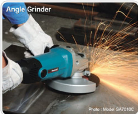
Photo : Model GA7010C